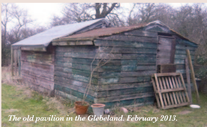
The old pavilion in the Glebeland. February 2013.