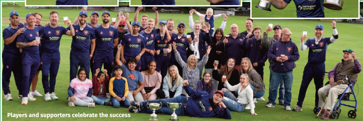
Players and supporters celebrate the success