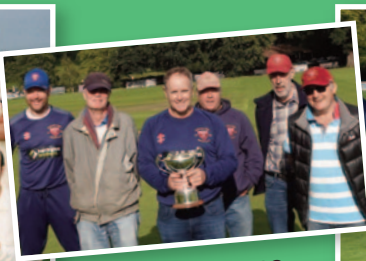
Veterans of 1988 - only Spider played in both finals.