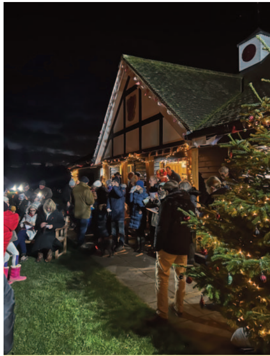
Christmas carols outside the pavilion on Sunday 17th December 2024. We hope this will be an annual event.

The fact that the Cricket Pavilion is the only building on the Green makes it ideal for many wider village functions and a list of such activities, mostly organised by the club, include - bonfire night firework display, keep fit sessions (I admit we didn't organise those), the catering at the annual village charity 'vintage sports car' show, Mayday celebrations, a Village Ball to commemorate the building of the new cricket