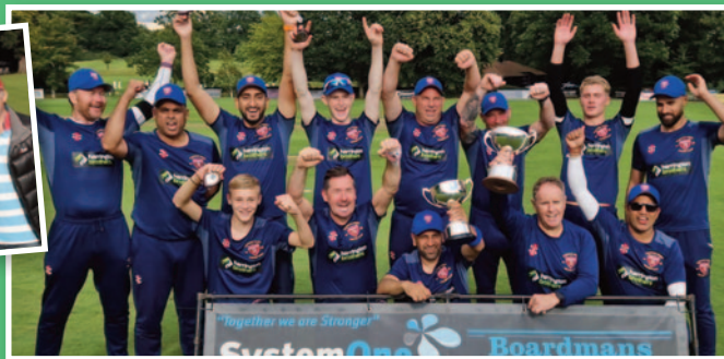
2023 Boardmans Davies Cup winners