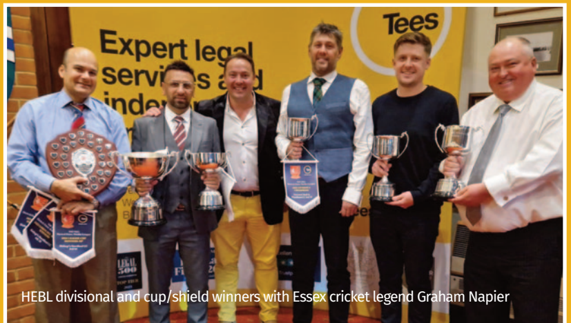
HEBL divisional and cup/shield winners with Essex cricket legend Graham Napier