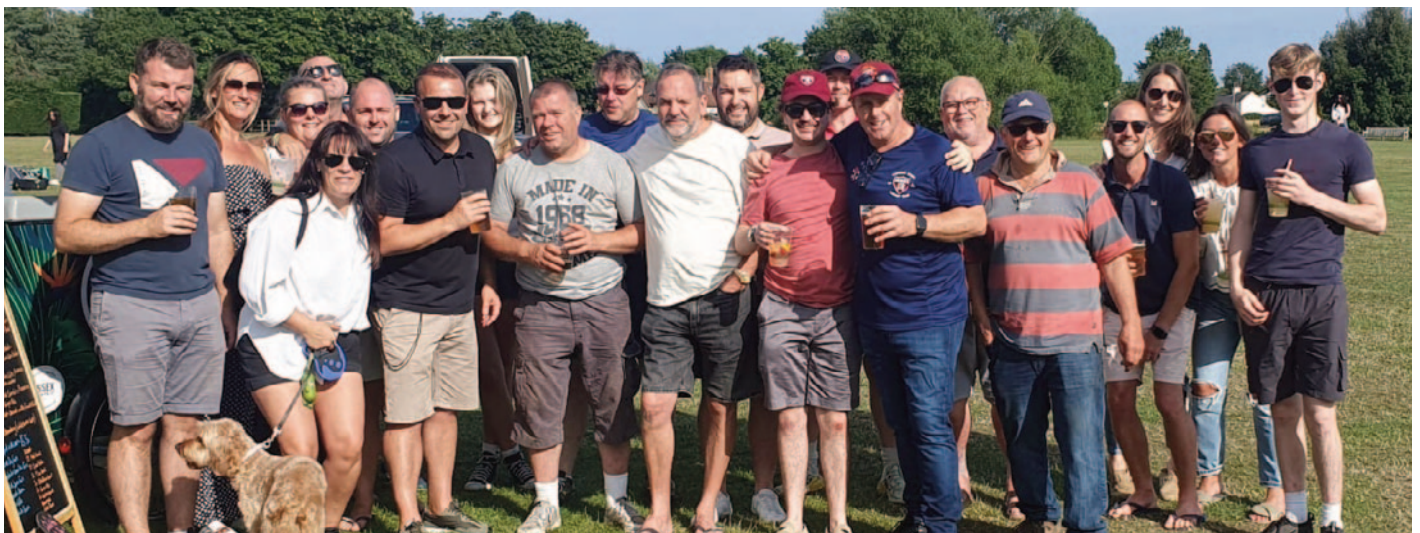
Team MGCC enjoying the last few dregs from a sold out bar after the 2023 Classic Car Show.

Please follow the club on Facebook, Instagram, Twitter and our YOUTUBE channel